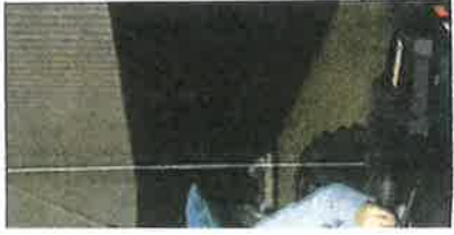
Aroostook Republican Climate Storage, and snowmobile and ATV