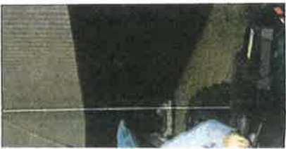
Aroostook Republican Climate Storage, and snowmobile and ATV

Both buildings are insu- lated two-and-a-half inches on the outside and inside, with concrete in the middle, Turn to Page 7, Jarosz