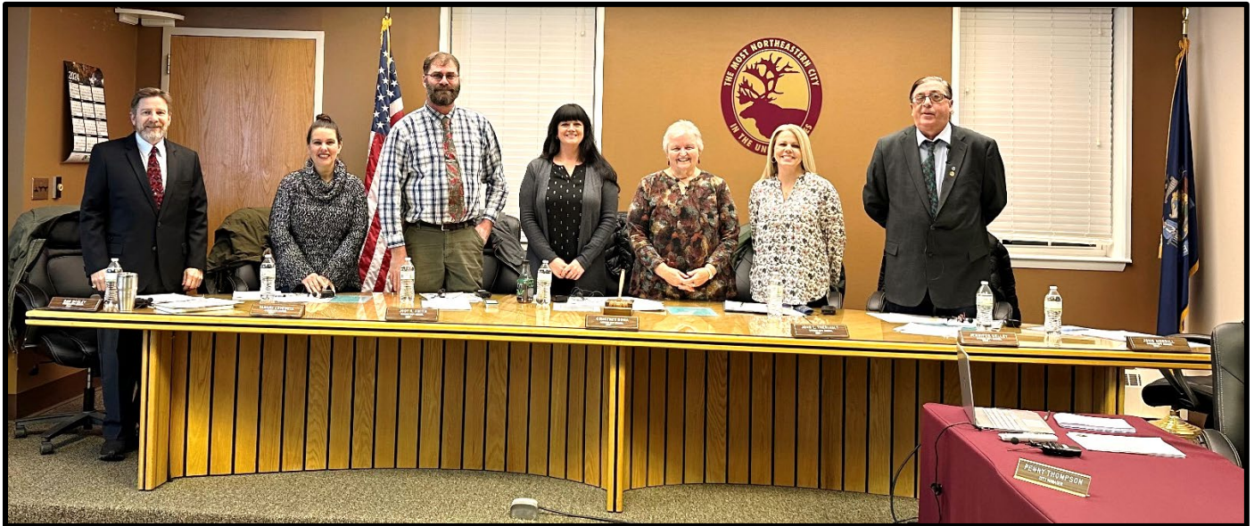
2024 Caribou City Council from left: