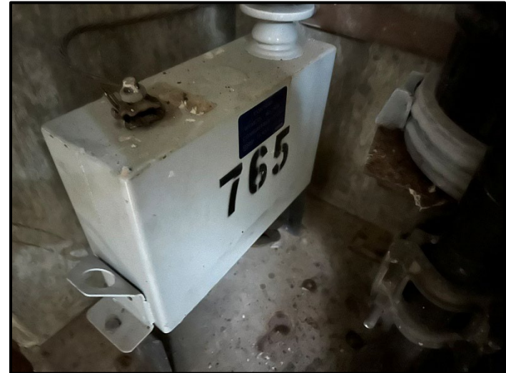
765 Transformer (No PCBs).