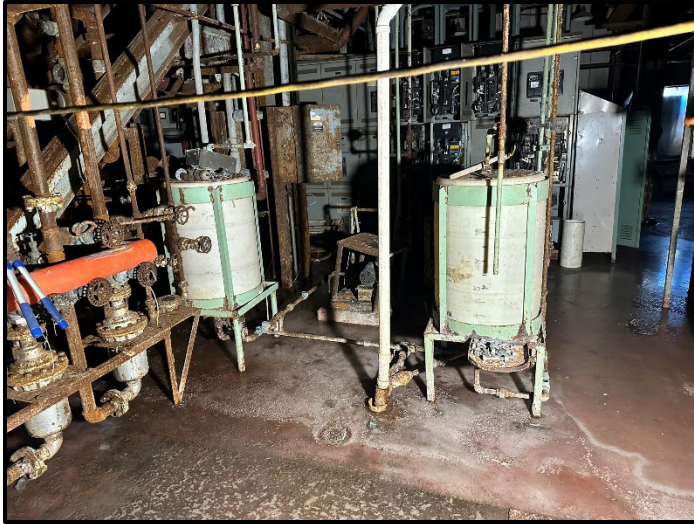
Water treatment chemical drums (two empty drums).