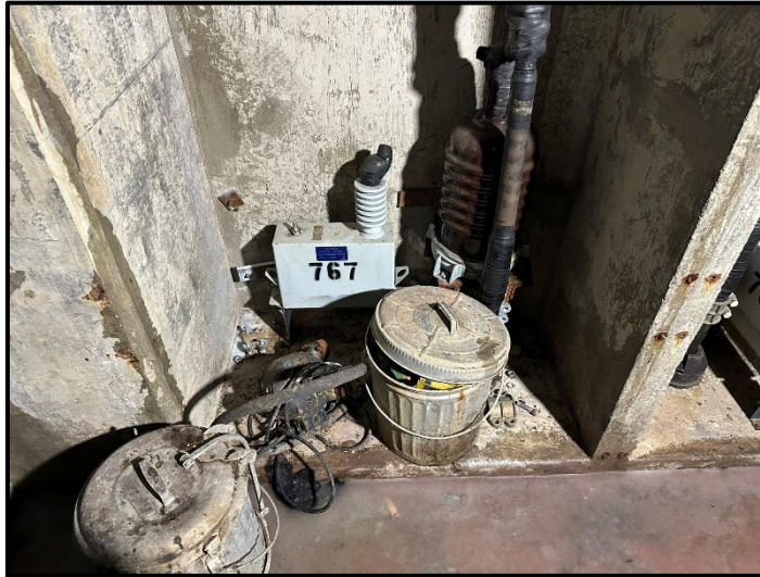
767 Transformer (No PCBs).