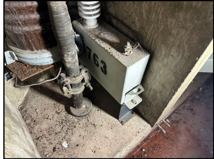
763 Transformer (No PCBs).