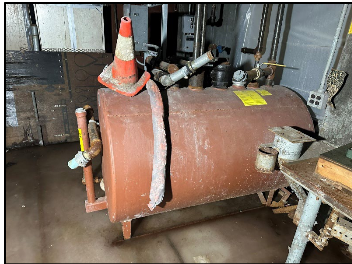
500-Gallon Heating Oil Tank (Diesel). Presumed empty with residual diesel and sludge.