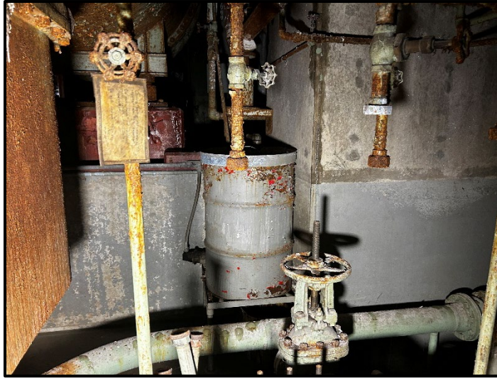
70-Gallon Fuel Transfer Pump Oil Reservoir.