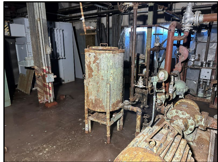
55-Gallon Drum (Engine Oil). Noted to be full of oil.