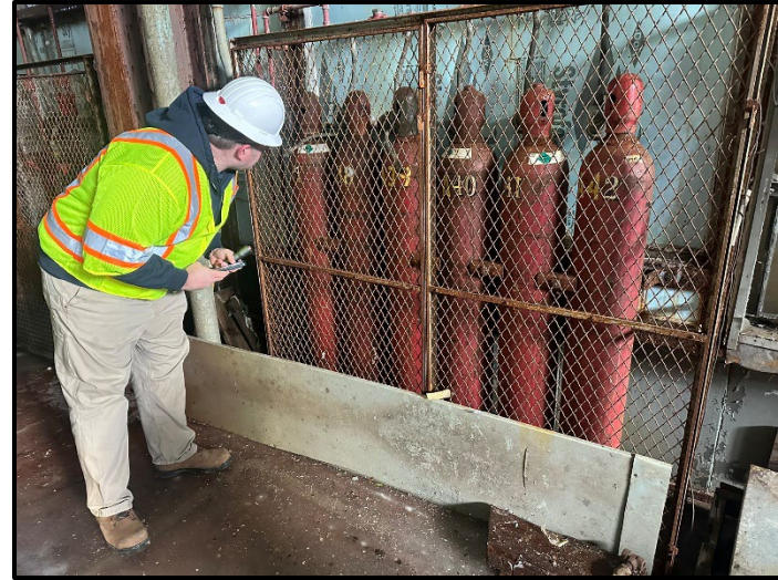
Compressed gas cylinders (carbon dioxide).