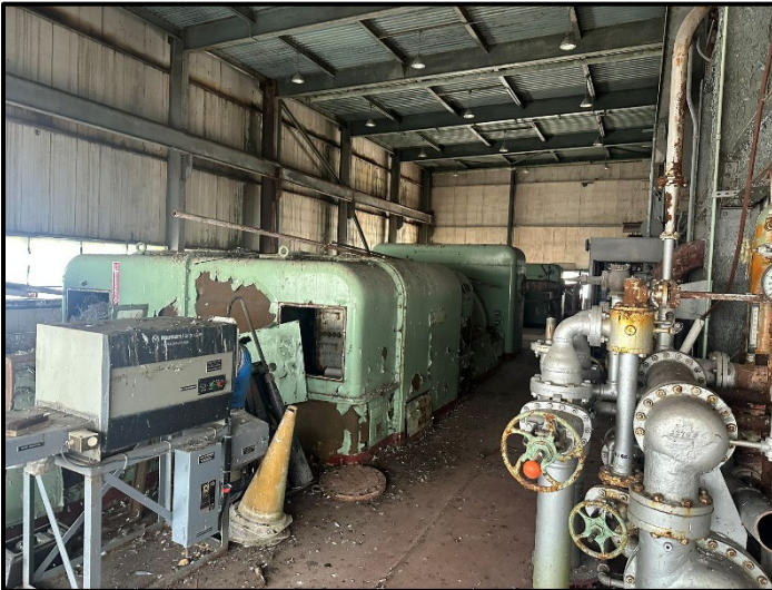
Turbines #1 and #2.