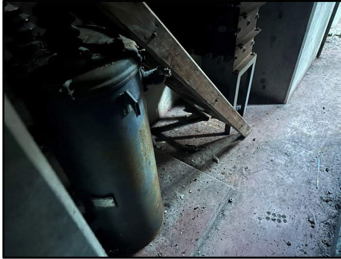
Transformer (~30 gallons oil). No labels.