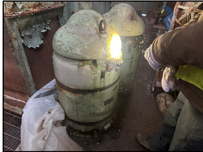
2 VisoLube vessels (4 total in Steam Plant).