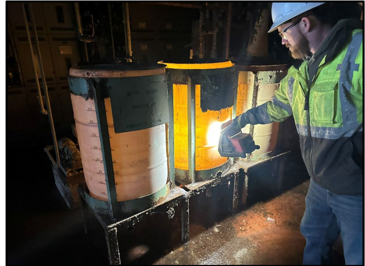
Water treatment chemical drums (three drums). Two empty drums. 1 drum contains ~10-gallons of Nalco water treatment chemical.