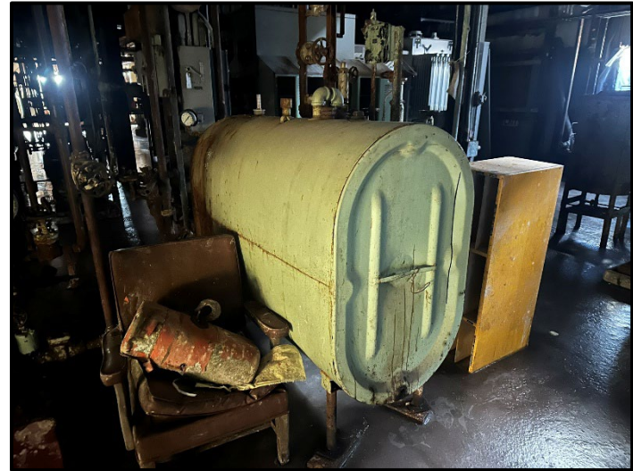
275-Gallon Used Oil Separation Tank (Waste Oil). Presumed empty with residual oil and sludge.