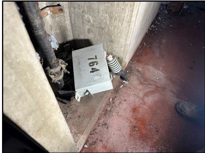
764 Transformer (No PCBs).