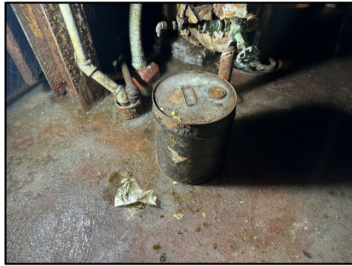
5-Gallon Unlabeled Pail (Unknown Contents).