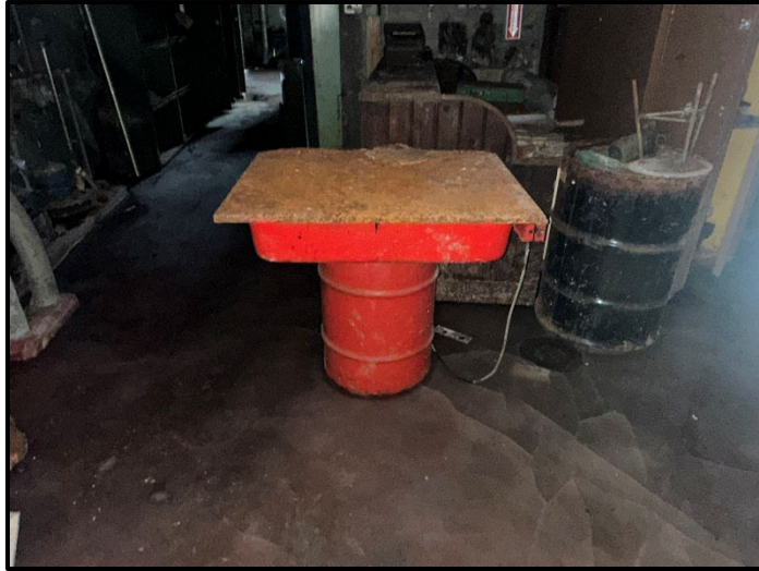
Parts Washer Tub with 30-Gallon Collection Drum. Noted to be partially-full of solvent.