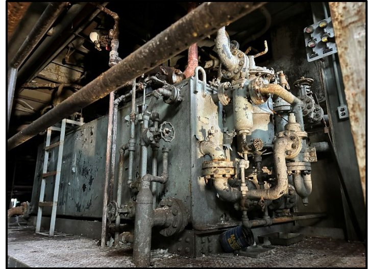
1,500-Gallon Turbine Waste Oil Reservoir. Presumed empty with residual oil and sludge.