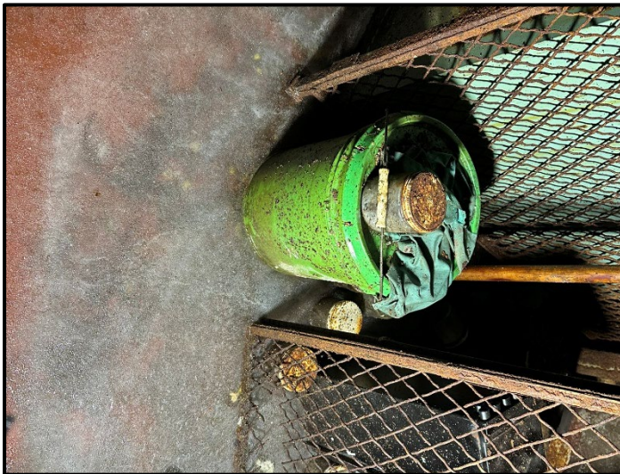
5-Gallon Unlabeled Pail (Unknown Contents).