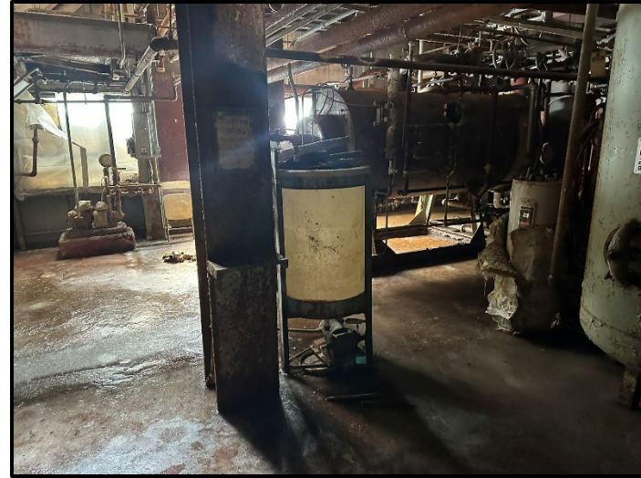
Water treatment chemical (one empty drum).