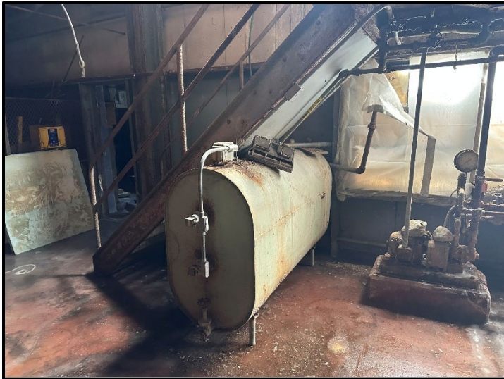
300-Gallon Heating Boiler Day Tank (Diesel). Presumed empty with residual diesel and sludge.