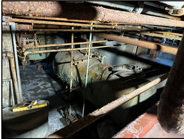
1,000-Gallon Turbine Lube Oil Drain Tank. Presumed empty with residual oil and sludge.